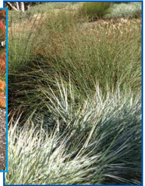
Lyme Grass (Oso Creek Trail)