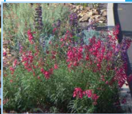
Penstemon (Marguerite Parkway at Pacific Place)