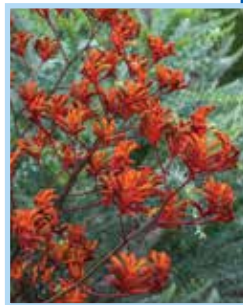
Anigozanthos (Kangaroo Paw)