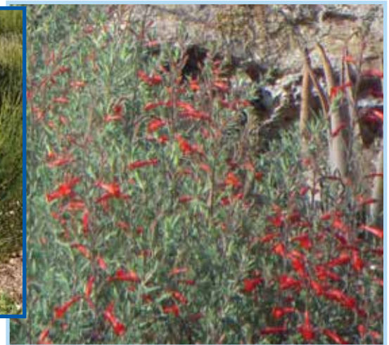
Epilobium (Marguerite Parkway at Pacific Place)