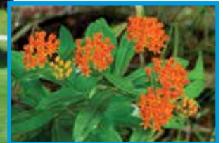
Asclepias (Butterfly Milkweed)