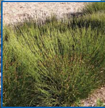
Juncus (Village Green)