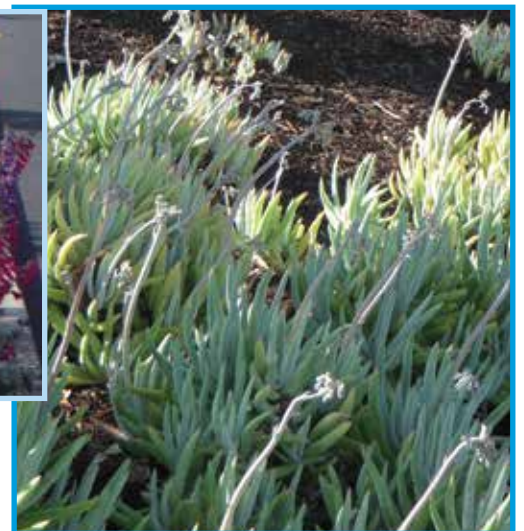
Cotyledon (Village Green)