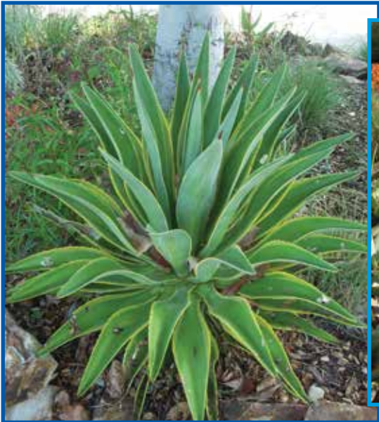
Agave (Oso Creek Trail)