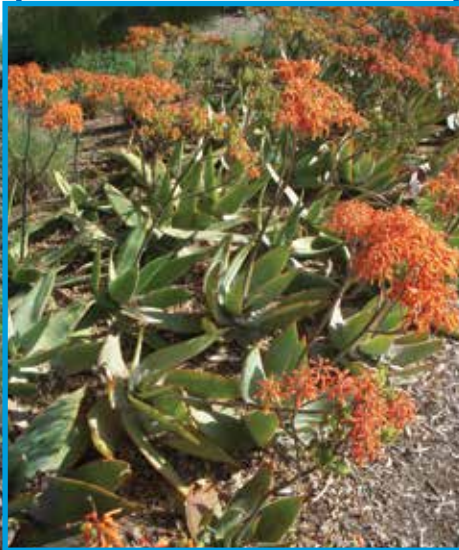
Aloe Strata (Marguerite Recreation Center)