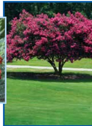
Lagerstroemia (Crepe Myrtle)