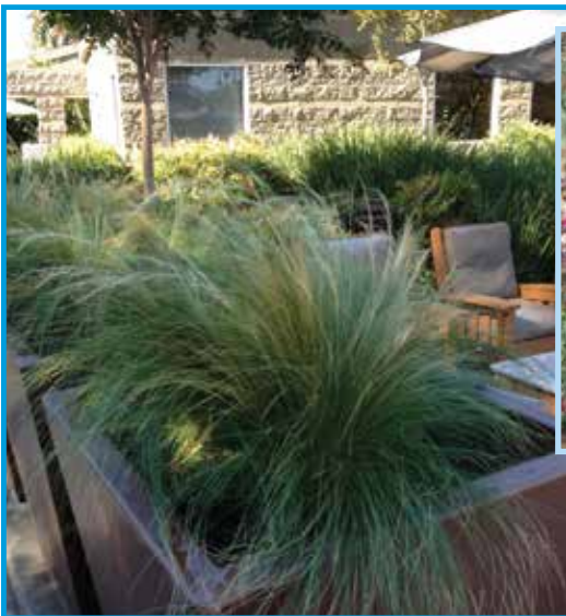
Mexican Feather Grass (Norman P. Murray Center)