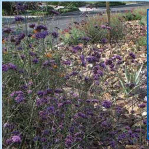
Verbena (Marguerite Parkway at Pacific Place)