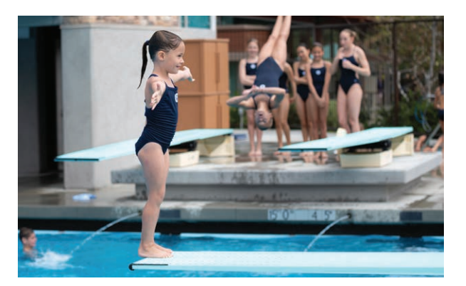
Over the years, the Nadadores' success has been inspirational for other sports and helped turn Orange County into a hotbed for Olympians.

The dive tower is the centerpiece of the renovation with the picturesque Saddleback Mountains serving as a backdrop. The tower was designed to meet the requirements of